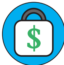
BEING FISCALLY RESPONSIBLE