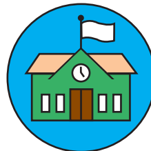
ADVOCATING FOR COMMUNITY